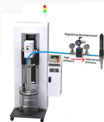
PRO-CP20 Pro Can Pump

Materials discharged at high pressure from PRO-CAN PUMP (PRO-CP20) or pneumatic CAN PUMP (TCP Series) will be reduced to appropriate pressure through LPR-100 and supplied to PRO-PUMP.